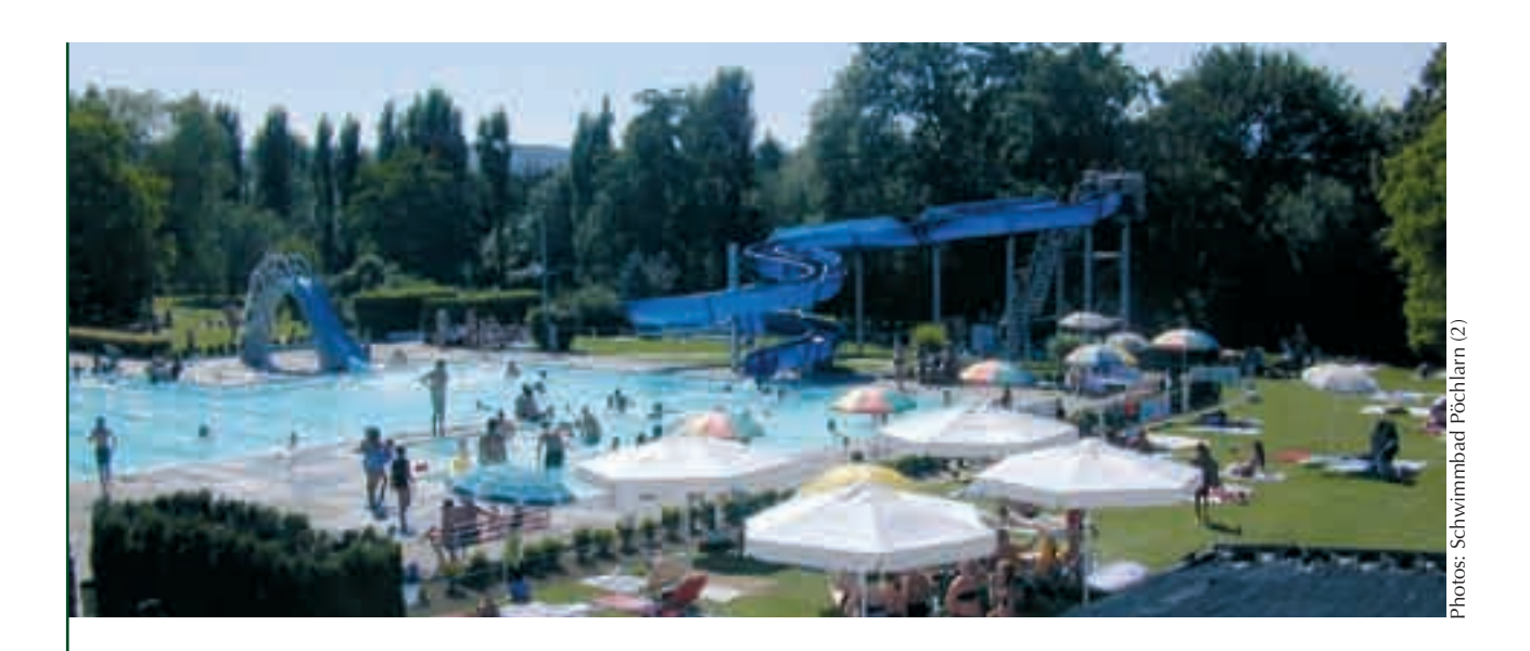
As part of a general redevelopment, a Grander water revitalization system was also installed in the Pöchlarn swimming pool.